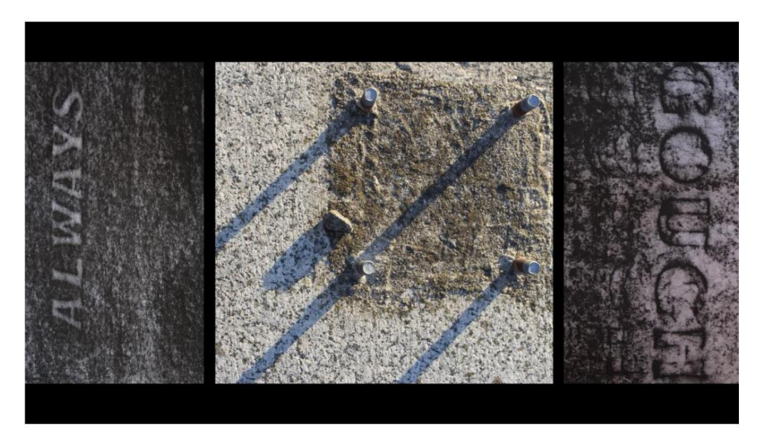
Figure 7. Paul Gough, Stoneology no. iii, 2017, charcoal, photo-montage and collage, 40 × 120 cm.

visits (Figures 7 and 8. The suite forms a visual parallel to the litany of memorial forms devised in 1917 by Sir Edwin Lutyens, which he described as a 'stoneology', a list of shapes, dimensions and textures that he thought might capture the fabric of memory, and which he consolidated into a four-square 'War Stone', or 'Great War Stone' that later morphed into the less severe Stone of Remembrance, which perhaps more aptly illustrates his intention (Geurst 2010, p. 22).