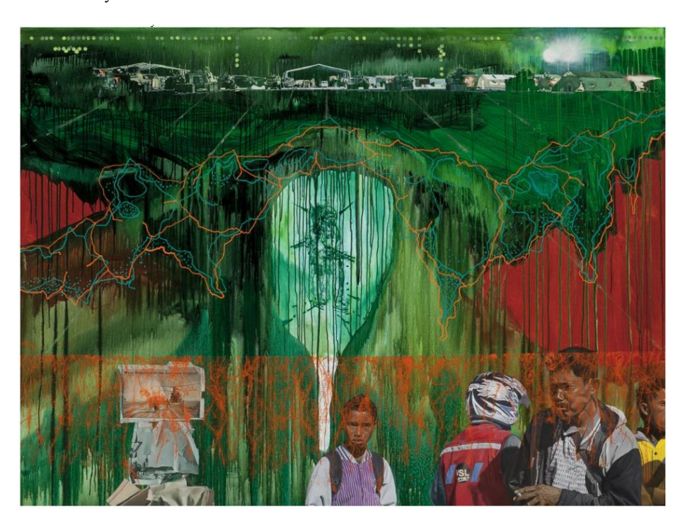
Figure 5. Lyndell Brown/Charles Green and Jon Cattapan, Spook Country (Maliana), 2014, oil and acrylic on linen, 185 × 250 cm. Private collection.