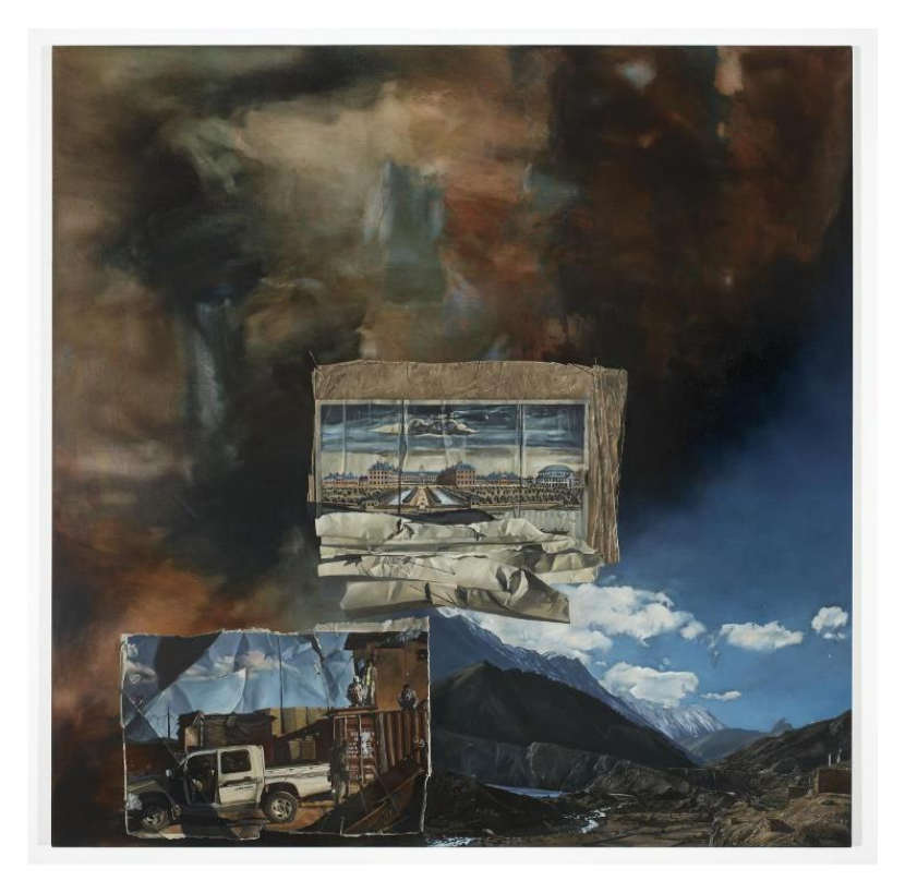
Figure 2. Lyndell Brown and Charles Green, Outpost, 2011, oil on linen, 170 \times 170 cm.