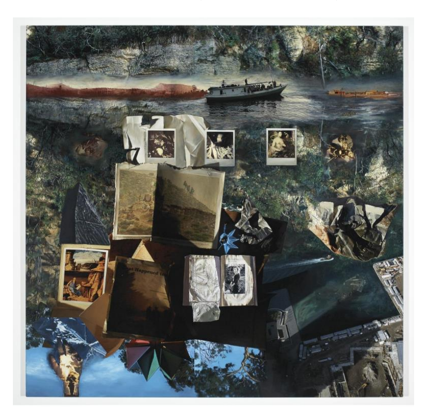
Figure 1. Lyndell Brown and Charles Green, The Dark Wood , 2011, digital print and oil on canvas, 121 × 121 cm.

in 2014, has a long association with the military. All four produce artworks (placed in national collections) and, as academics (at the University of Melbourne and RMIT University, Melbourne), reflect deeply (and publish widely) on the heritage of conflict and war by interrogating contemporary art's representations of war, conflict and terror (Brown and Green 2008).