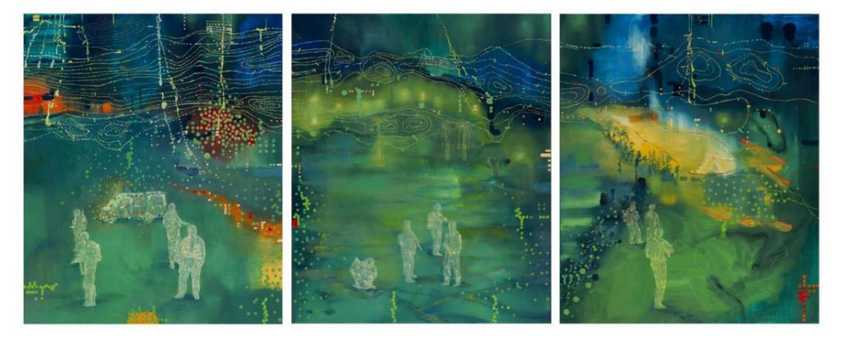
Figure 3. Jon Cattapan, Night Figures (Gleno), 2009, oil and acrylic on linen, 180 × 250 cm. Private Collection.

This foreboding mood informed the cycle of paintings made on his return to Melbourne. The large and highly significant triptych, Night Patrols, Maliana (2009), is a compendium work that conflates many of the patrols and nocturnal places into something of a spectral gathering. We see similar pictorial concerns addressed in the triptych Night Figures, Gleno (Figure 3). 'The paintings in this series,' one reviewer wrote, 'are imbued with notions of anxiety and surveillance, and evoke in the viewer feelings of voyeurism and invasion of privacy.' The soldiers are observers but are also being observed. As they roam the benighted villages they too are being scrutinised and followed by unseen eyes. Luminous and larger than life, the soldiers seem at odds with the unfamiliar land, with its uncanny vivid greens and tracery of dots and lines. Every effort at integration and communication seems to be frustrated by their very alien presence, accentuated by their virulent painterly difference (Green et al. 2015, pp. 168–73).