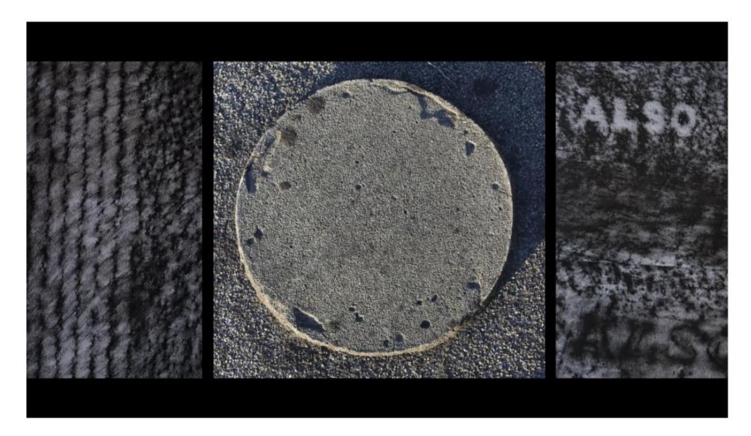
Figure 8. Paul Gough, Stoneology no. viii, 2017, charcoal, photo-montage and collage, 40 × 120 cm.