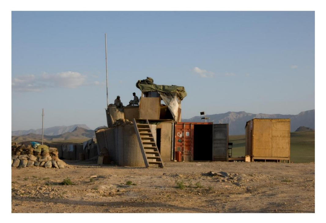
Figure 6. Lyndell Brown and Charles Green, Afghan National Army Perimeter Post with Chair, Tarin Kowt, Uruzgan Province, Afghanistan, 2007–2008, editioned digital colour photograph, inkjet print on rag paper, 111.5 × 151.5 cm. Collection National Gallery of Victoria.

Few have defined the diffuse spatiality of the post-modern battlefield better than Australian War Memorial curator Warwick Heywood: